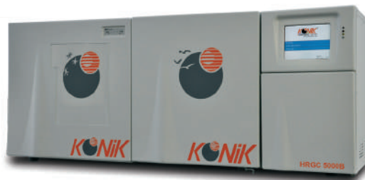
KONIK MSQ12 GC