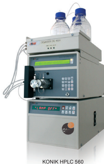
KONIK HPLC 560